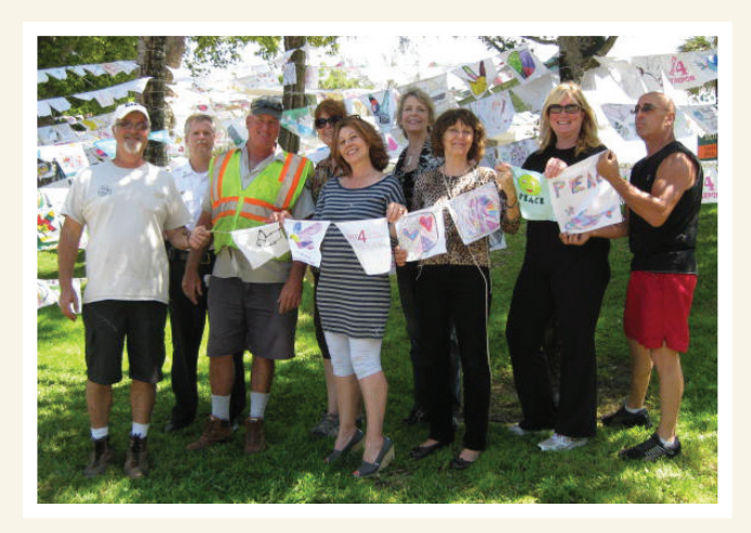
Volunteers at Peace Flag Event

Hundreds of Tarpon Springs residents had played a role. An art therapist helped the minister organize the event. A local hotel donated sheets to be cut into flag-sized pieces. Interns from St. Leo's College did outreach, taking materials to the Farmer's Market, the library, local businesses, churches and schools and collecting completed flags. The Mayor issued a proclamation in support of the event. The City Manager overcame a local ordinance prohibiting hanging materials in public spaces by deeming the project a public art installation. A Unitarian church quilting circle sewed flags together, and volunteers and city employees spent a day stringing them up. The project was timed to coincide with an annual Arts Festival which attracts thousands to the area. As pedestrians and motorists stopped to observe, P4T was there explaining why it is so important to address trauma and demonstrating the power of community involvement.